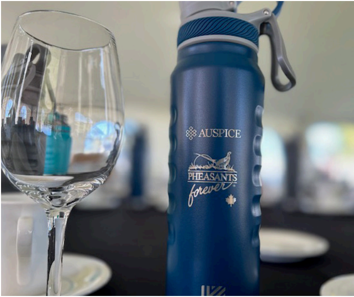
Auspice & PF bottles were a hit.