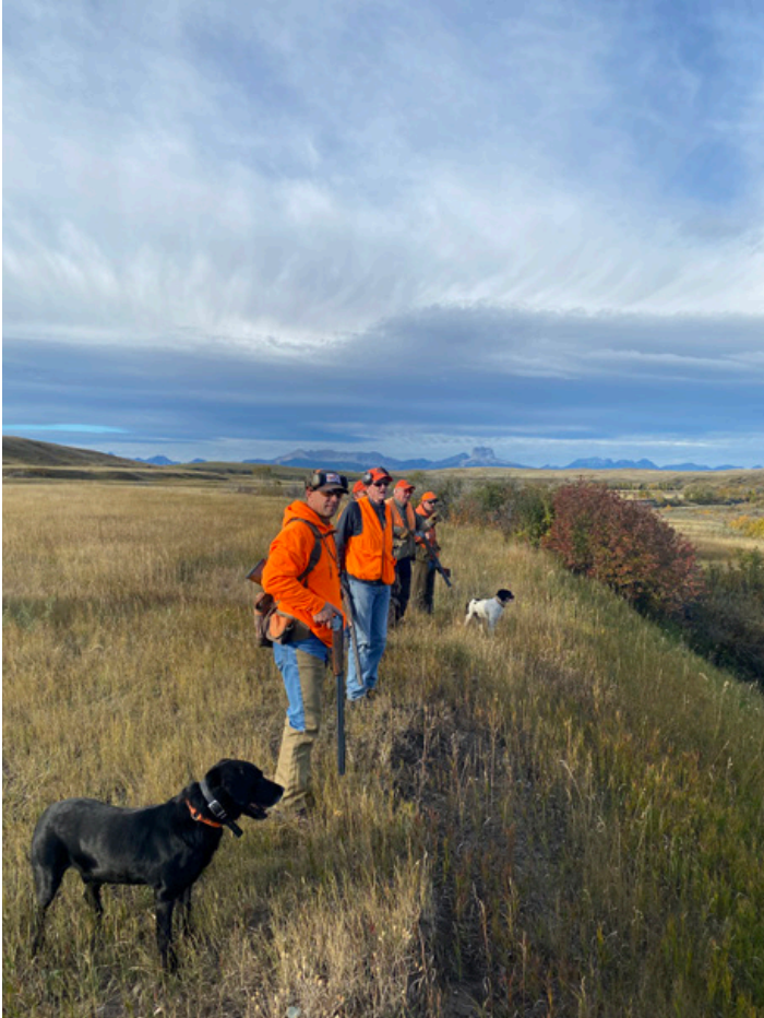
Preparing the next drive.