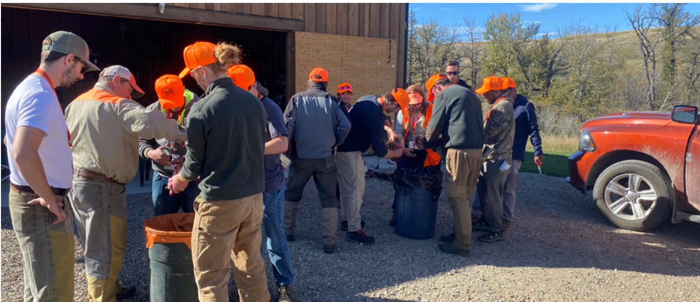
Cleaning seminar gets underway.