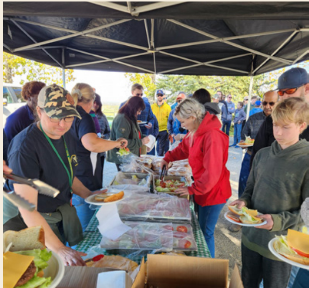
Lunch was provided.