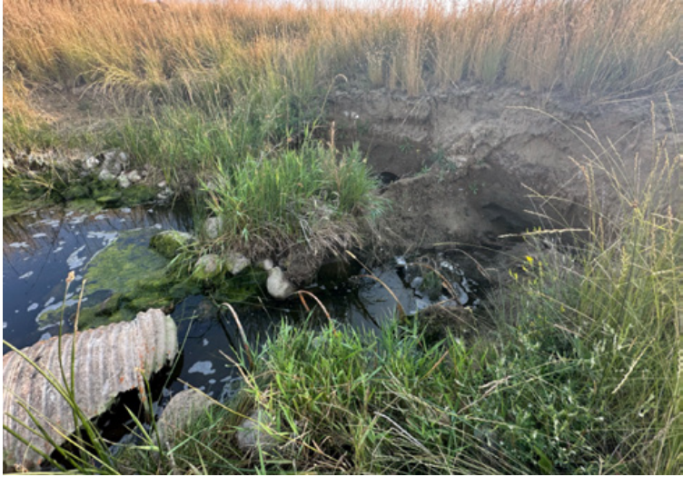
Control structure requires extensive repair.

Pheasants Forever will be investing $90,000 into repairs on irrigation infrastructure on one of the basins this fall to ensure the project's long-term vitality.