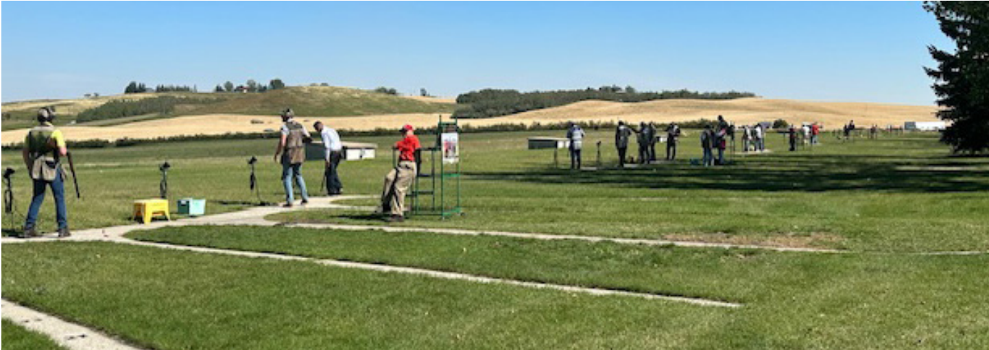
A beautiful day at the AHEIA Calgary Firearms Centre.