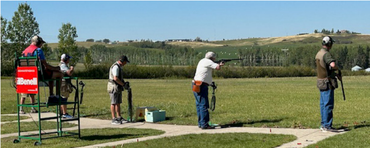
The action begins.