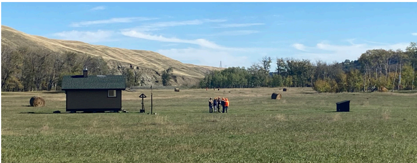
Field station at the very scenic Rump's River Retreat.