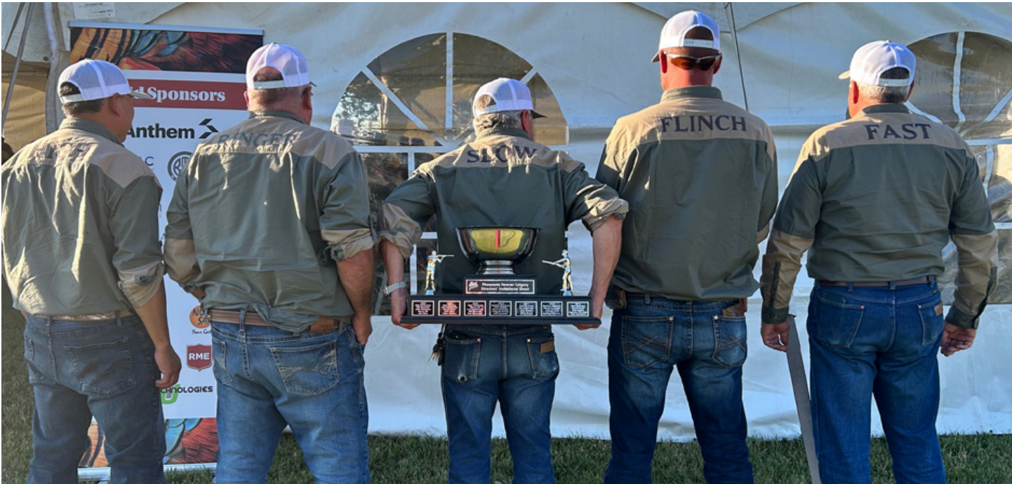
The Five Losses: High, Ringer, Slow, Flinch and Fast.