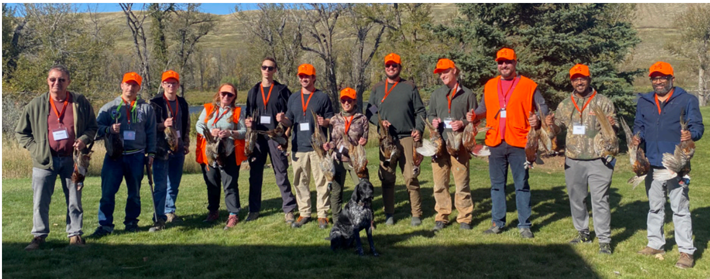
A great group of mentees.