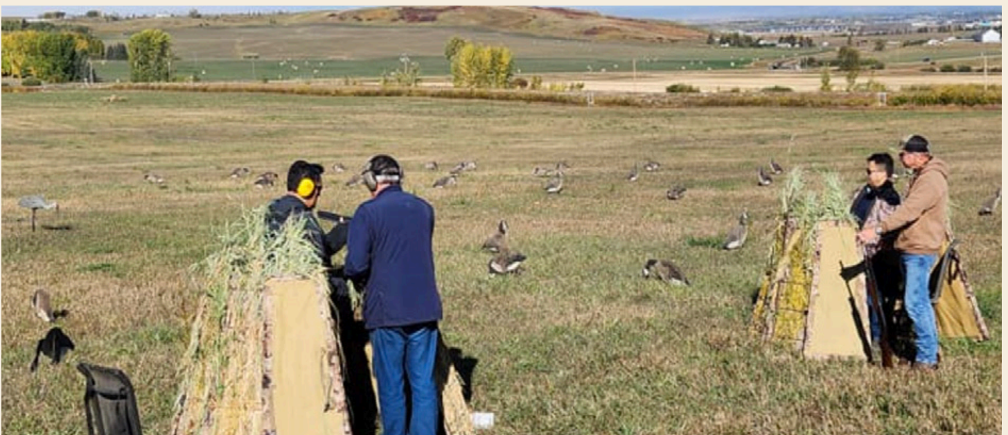
The simulated field fowl hunt.

Pheasants Forever is a proud sponsor of the annual event.