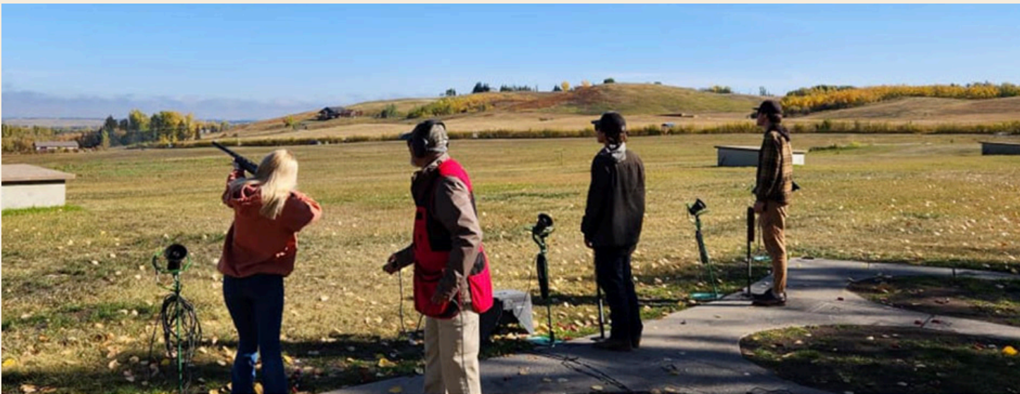
First timer getting coached on trap shooting.