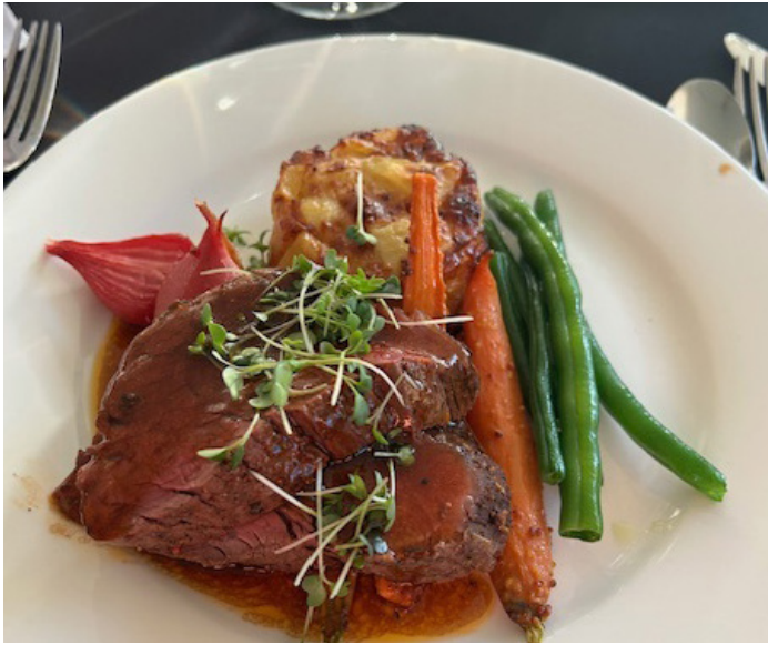
A sample of the great food.