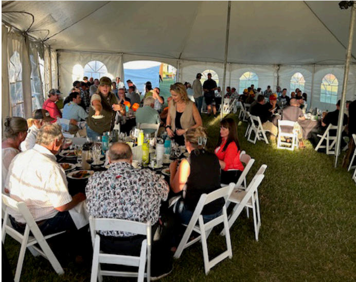
Dinner gets started.