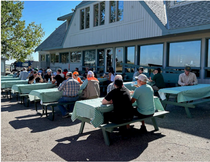
Calcutta about to start.